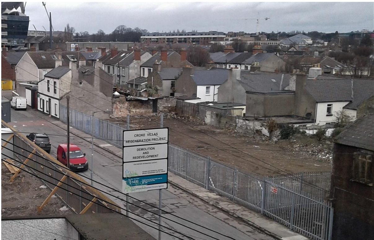
Demolition work on the former cottages on Sackville Avenue is now complete and the two sites cleared.