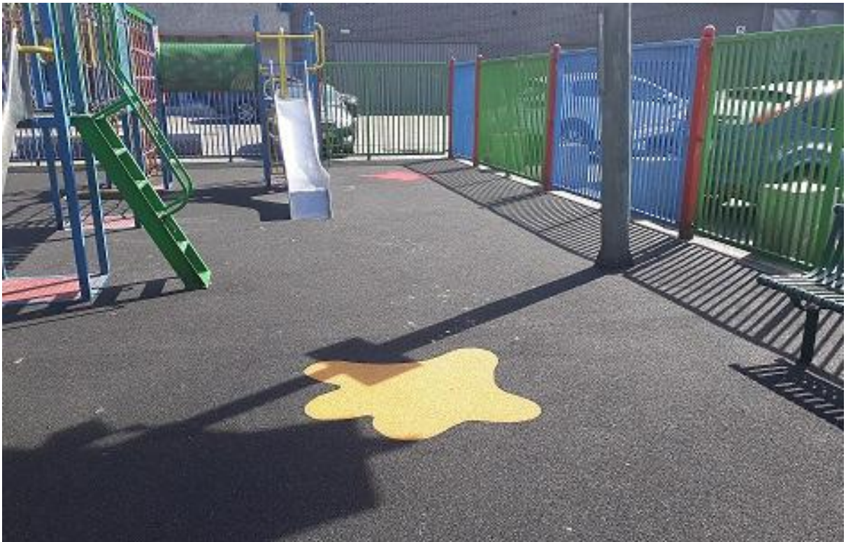
Upgrade works to playground at Liberty House now complete.