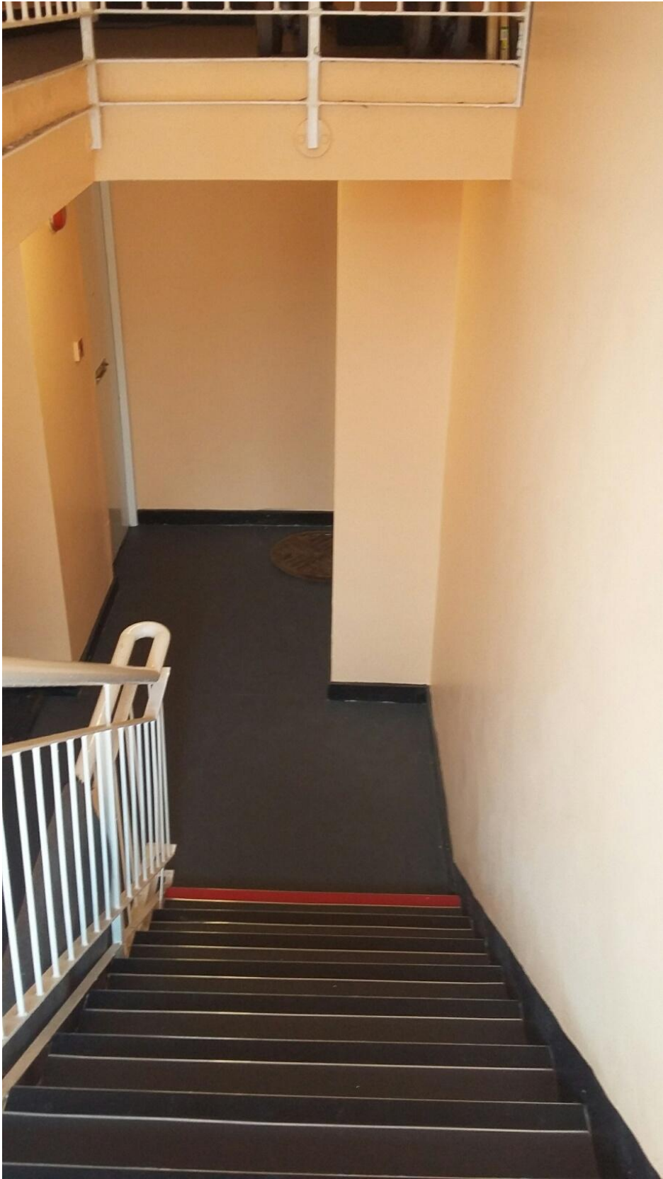
Painting of hallways/stairs, landings and banisters is now complete.